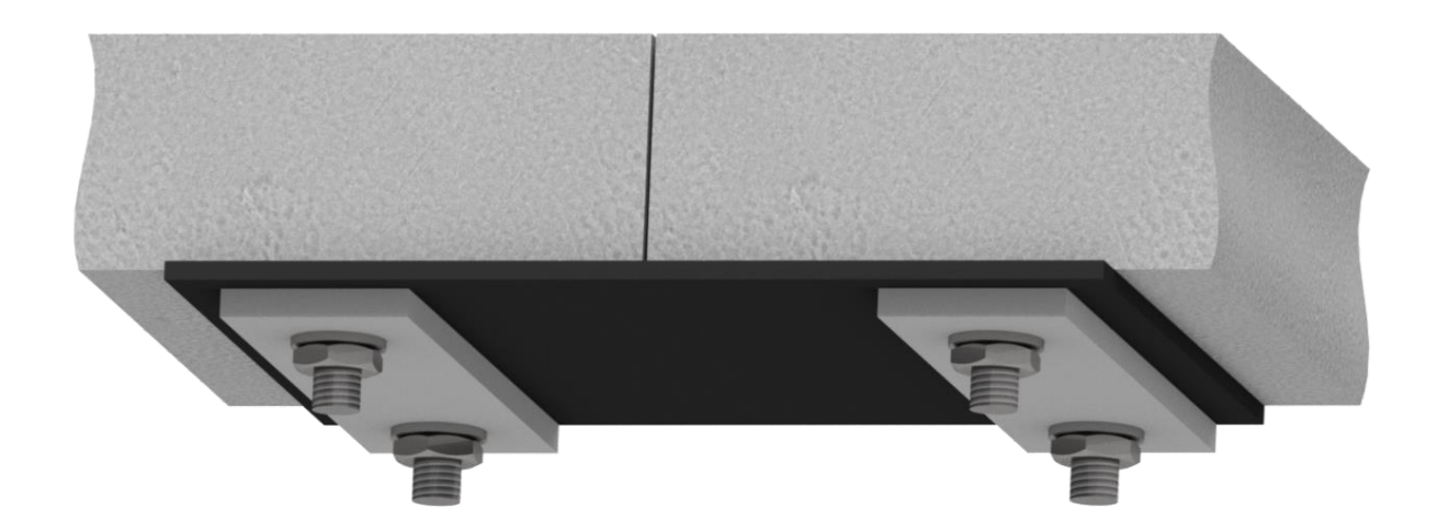
All dimensions in mm